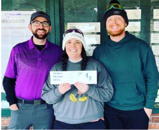
Arzaga, Arzaga, Brock took over all first.