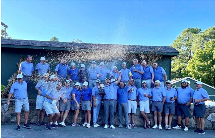
Team Maumelle celebrating their back to back wins

Maumelle Country Club won the 2021 Mayors Cup to take a lead in the running total. Mayors Cup 2021 was the 19 th annual for the competition. They won 27 to 12. The Mayors Cup is a long standing tradition where the golf courses in Maumelle play against each other in a Ryder Cup style.